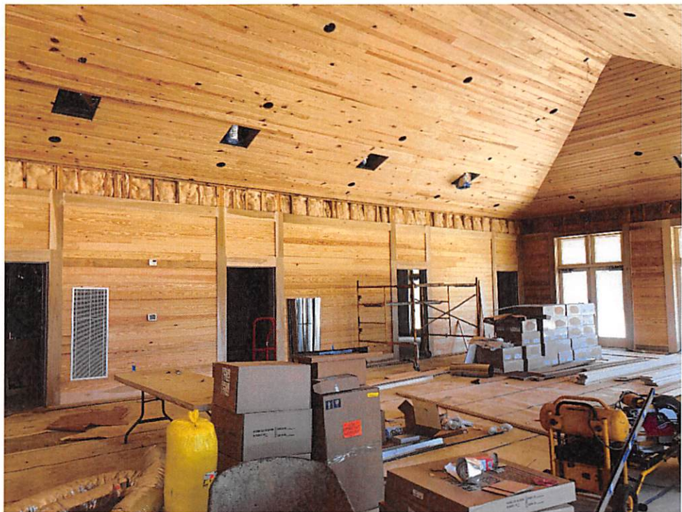
Figure 4 – Great Room in the Health Center