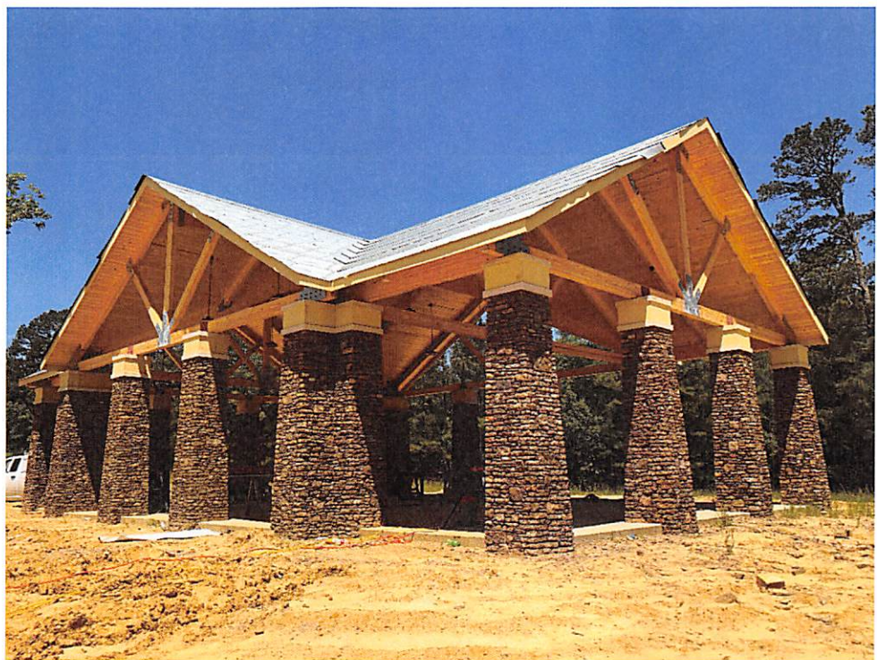
Figure 10 – Exterior view of the pavilion