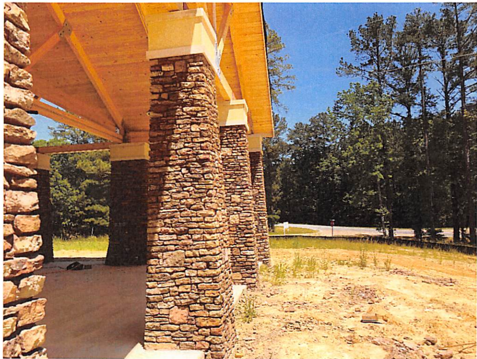
Figure 12 – Brick columns installed at the pavilion