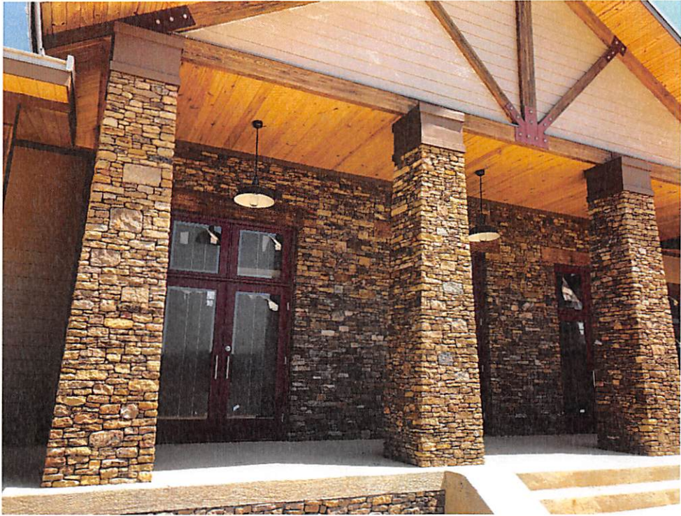
Figure 1 – Health Center Building