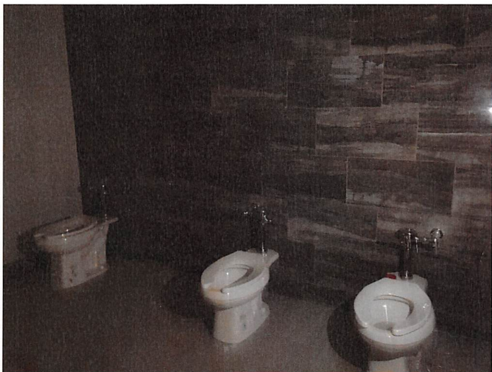
Figure 8 – Wall tile installed in both bathrooms of the health center