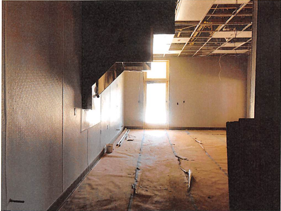
Figure 5 – Hood installed in the Kitchen