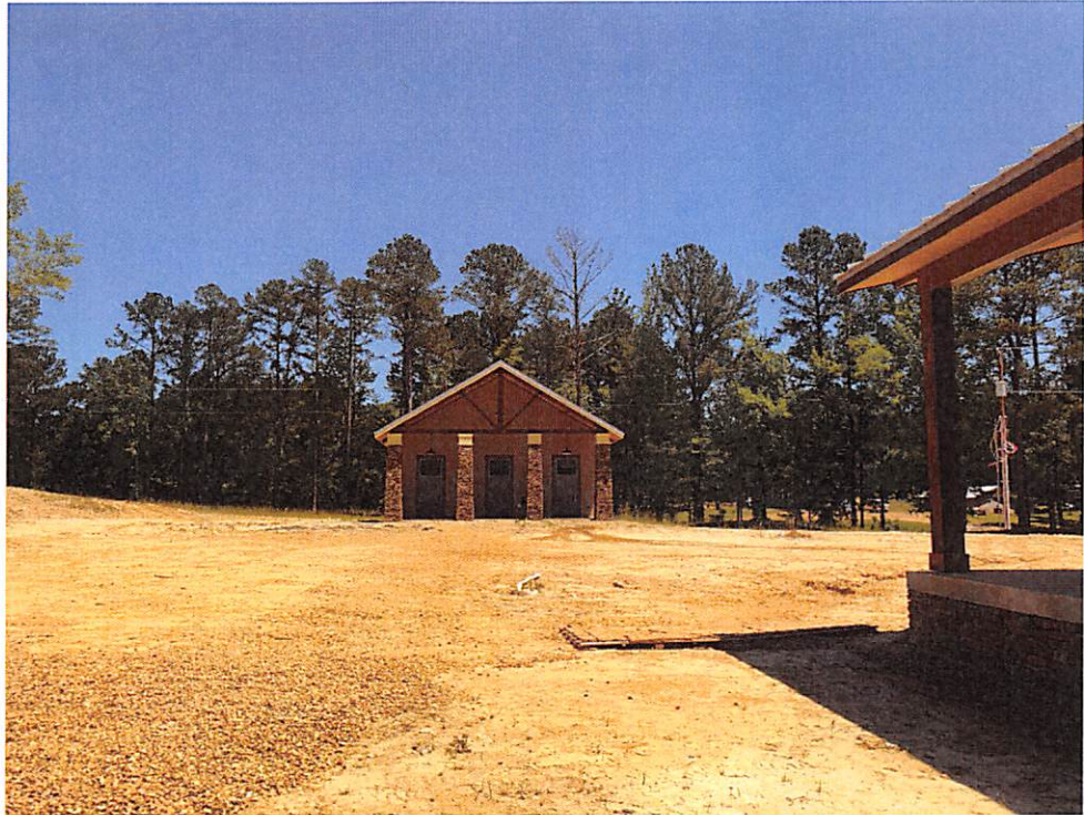
Figure 9 – Exterior View of the Restroom Building