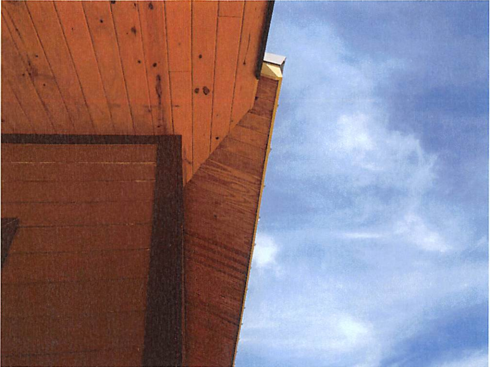
Figure 2 –Porch of the Health Center