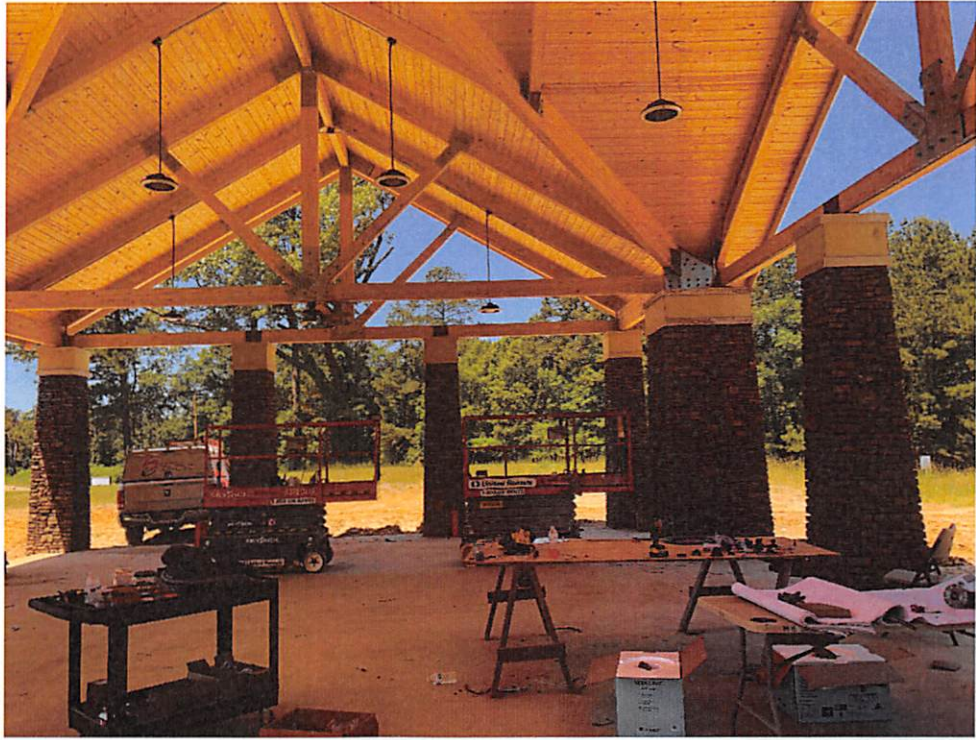
Figure 11 – Lighting fixtures and fans being installed at the pavilion