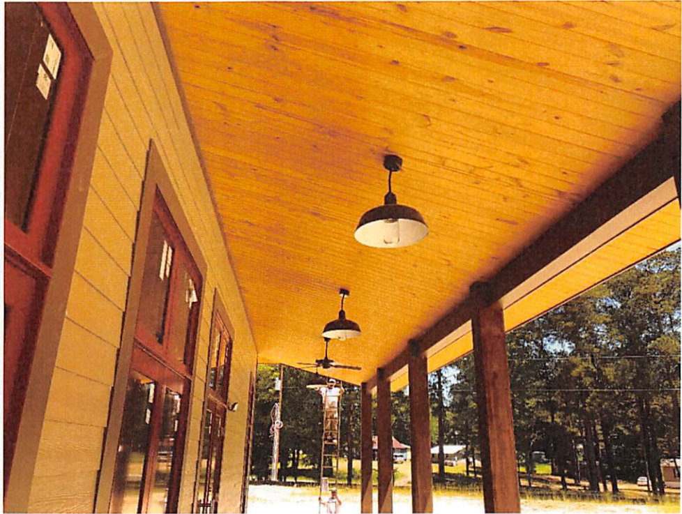
Figure 3 – Health Center Porch