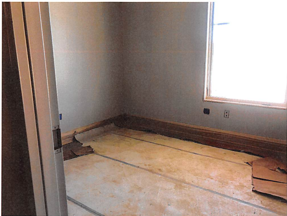
Figure 6 – Wood base installed in the office of the health center